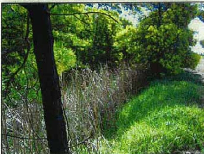
Figure 4: Cut drain along western boundary