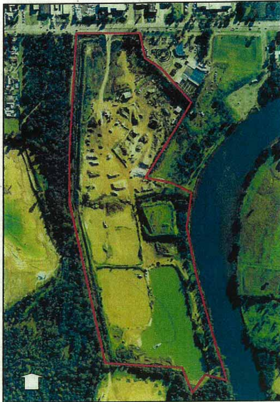
Figure 1: Lot 1 in DP 515738