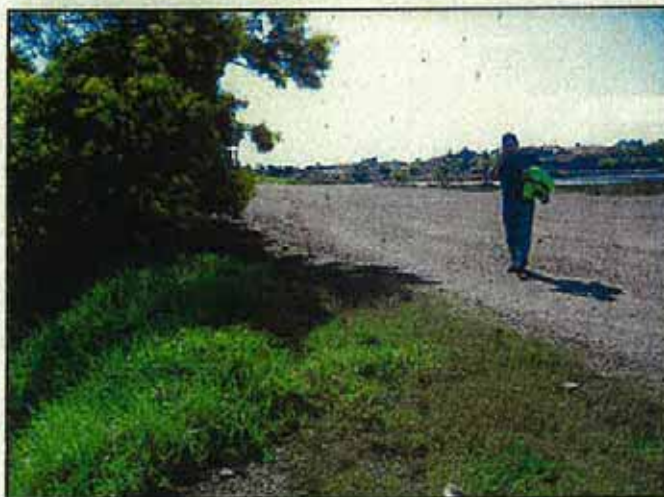
Figure 6: Perimeter road in western portion of Lot, adjacent to cut drain and settling pond