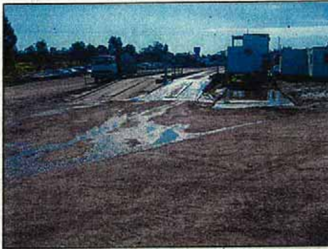
Figure 2 : Northern portion of sites showing weighbridge, office and car park