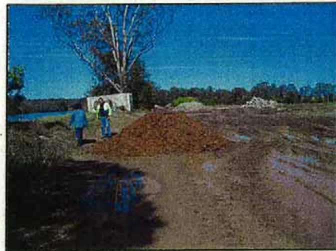
Figure 5 : Filled sand excavation areas and stock piles along edge of Georgas River