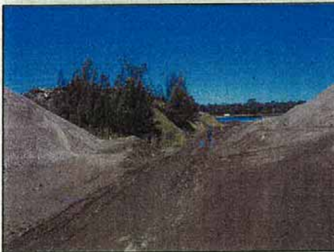
Figure 3 : View to south on eastern side of land showing sand stock piles and settling pond